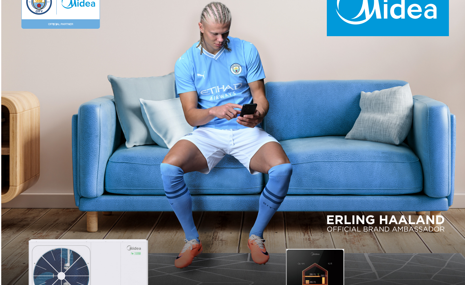
ERLING HAALAND OFFICIAL BRAND AMBASSADOR